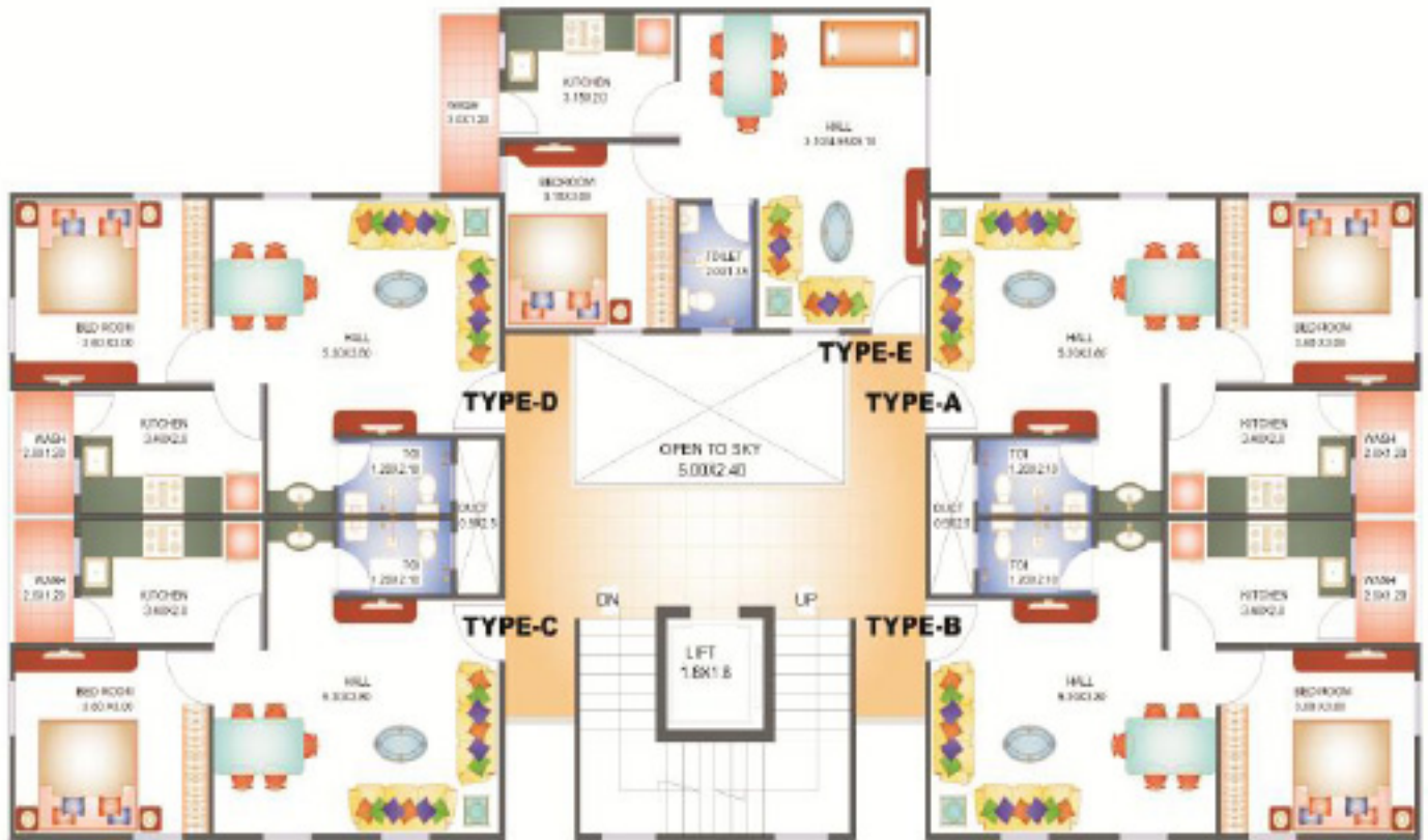
LIG BLOCK ( 1 BHK ) ■ 44 Unit