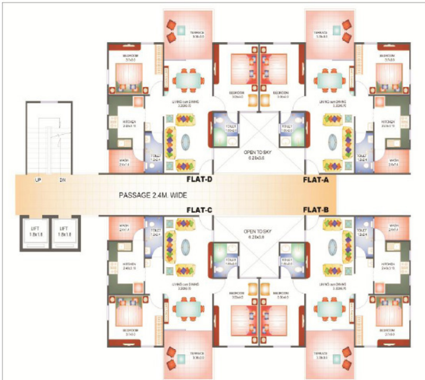
2 BHK UNIT PLAN ( Block No. 13,14,15,16 &17 ) ■ 210 Unit