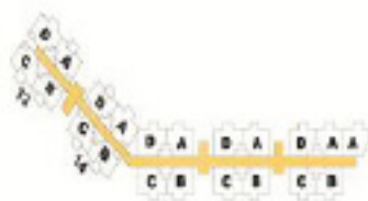
2 BHK UNIT PLAN (Block No. 13,14,15,16 &17)